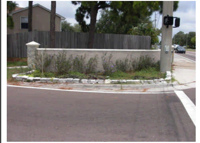
Clean up & planting of Woodmont entrance island - July 11th

To book a tee time, contact the Bobby Jones Golf Club: 941-365-GOLF or visit www.bobbyjonesgolfclub.com .